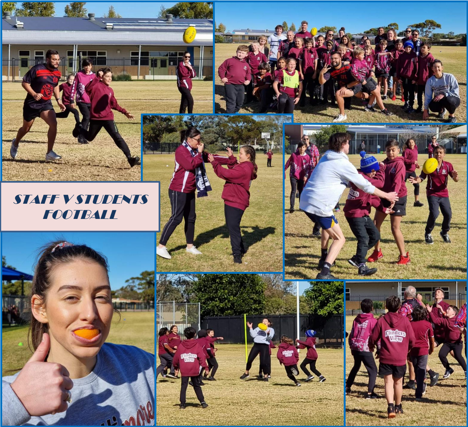
STAFF V STUDENTS FOOTBALL